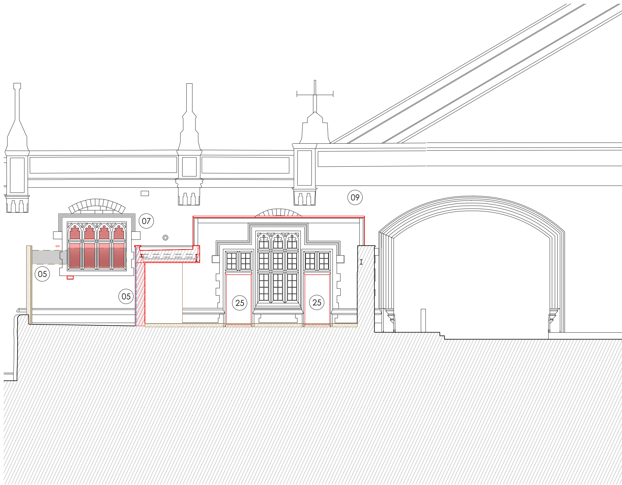
01 Section GG 0142 Demolition